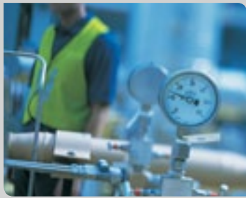
Field Force Automation